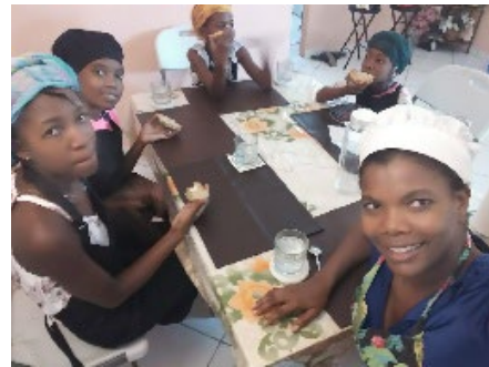
Small group Bible Study